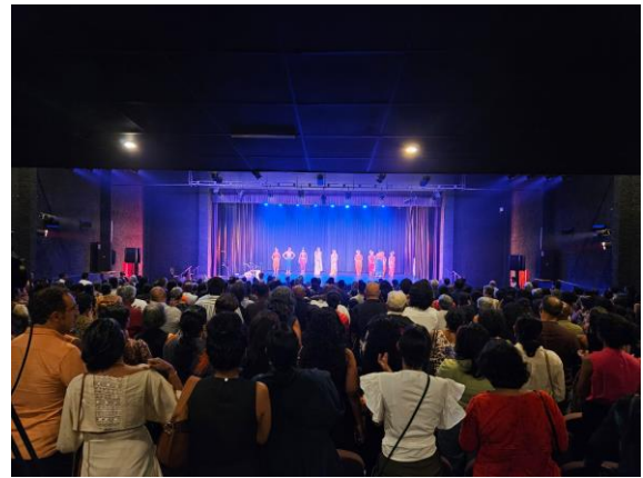
Audiences at the performances held at the Bishop's College Auditorium, Colombo.