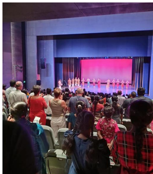
Audience at the performance held at the Jaffna Cultural Centre