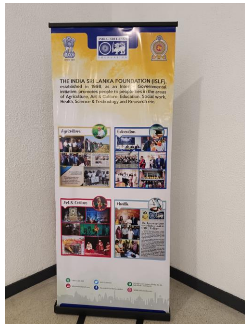
Images of the ISLF banners displayed at the Colombo venue.