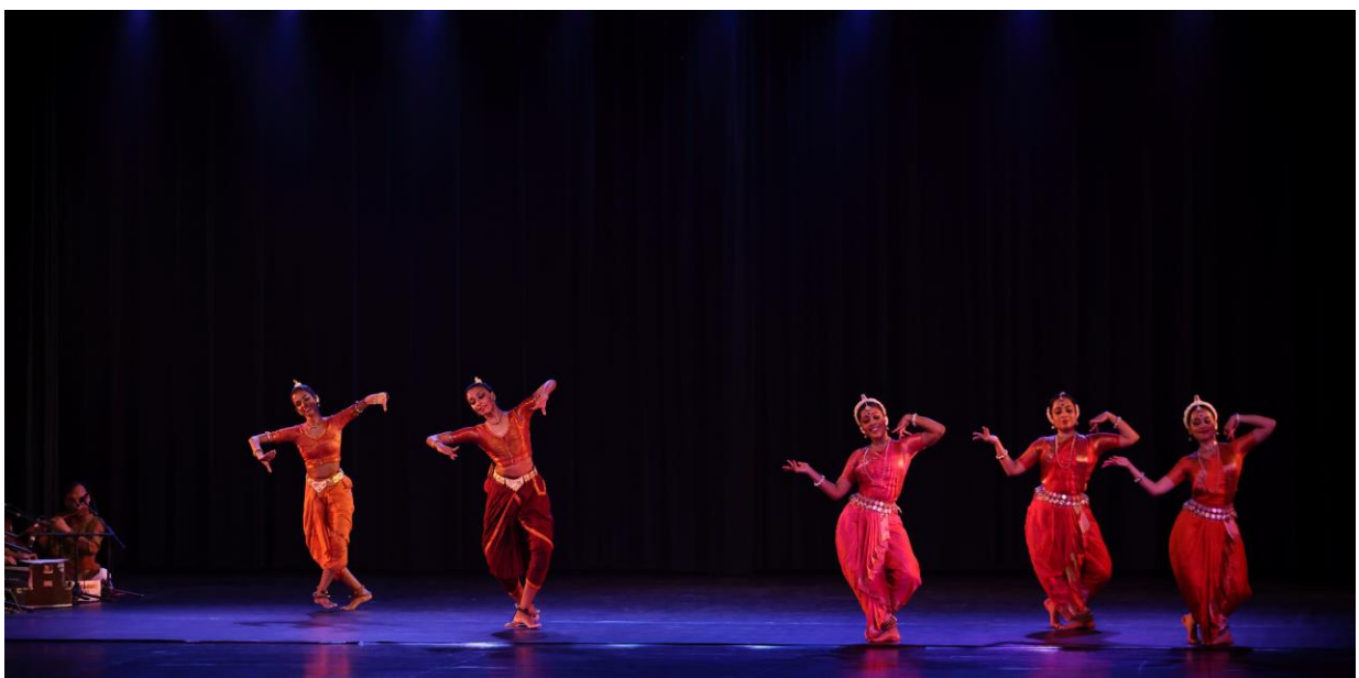
Images of the performances